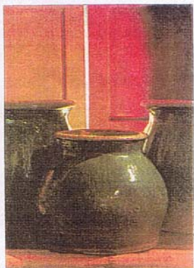
Rare Phuket pieces including stoneware water jugs at China House.

All the houses are typically long and narrow. Carved teak louvers on the windows and wooden inlaid doors marking Chinese characteristics are combined with European designs of Corinthian columns or Doric decoration. In the centre of the expansive narrow homes an open-air garden, which adds natural light and beauty, also circulates a cooling breeze. A further glimpse at this middle class lifestyle of bygone days can be seen on nearby Krabi or Dibuk roads and along Soi Romance.