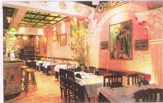
Salvatore's was voted the Best Restaurant in Thailand in 2003 by Thailand Tatler.

Phuket has over 150 Sino-Portuguese buildings listed for preservation by the Fine Arts Department. Although this history has all but disappeared from the island, a walk in Old Phuket town reflects the rich and diverse past of its multicultural heritage.