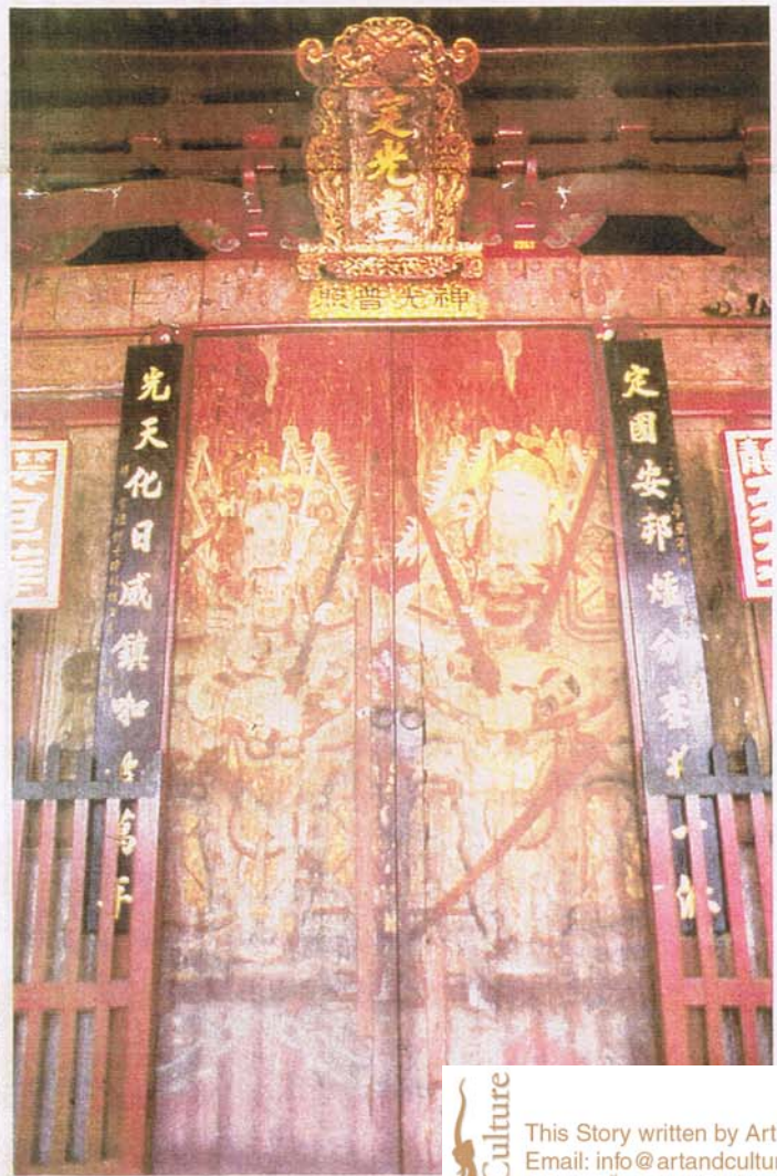
♦ Continued on page 8 Entrance to the Shrine of the Serene Light believed to be 120 years old.

This entire area shows fabulous examples of Sino-Portuguese architecture, dating back more than 150 years.