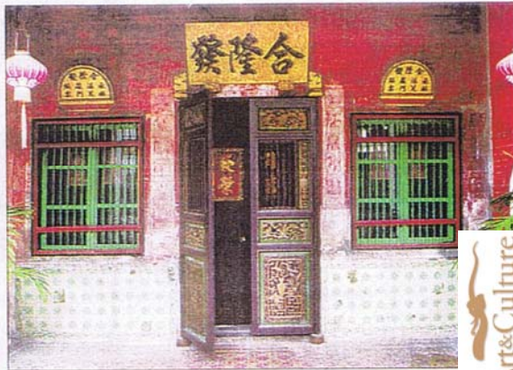
A Sino-Portuguese house on Thalang Road.