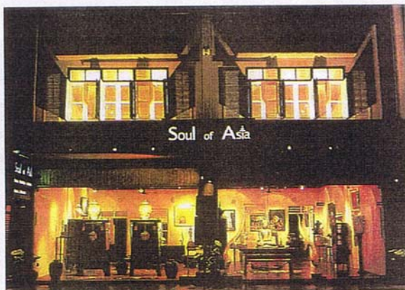
Soul of Asia has an eclectic collection of Asian and Western art including Picasso originals.

The trip will focus on birds in evergreen forest. The cost is 2,800-3,200 baht/person depending