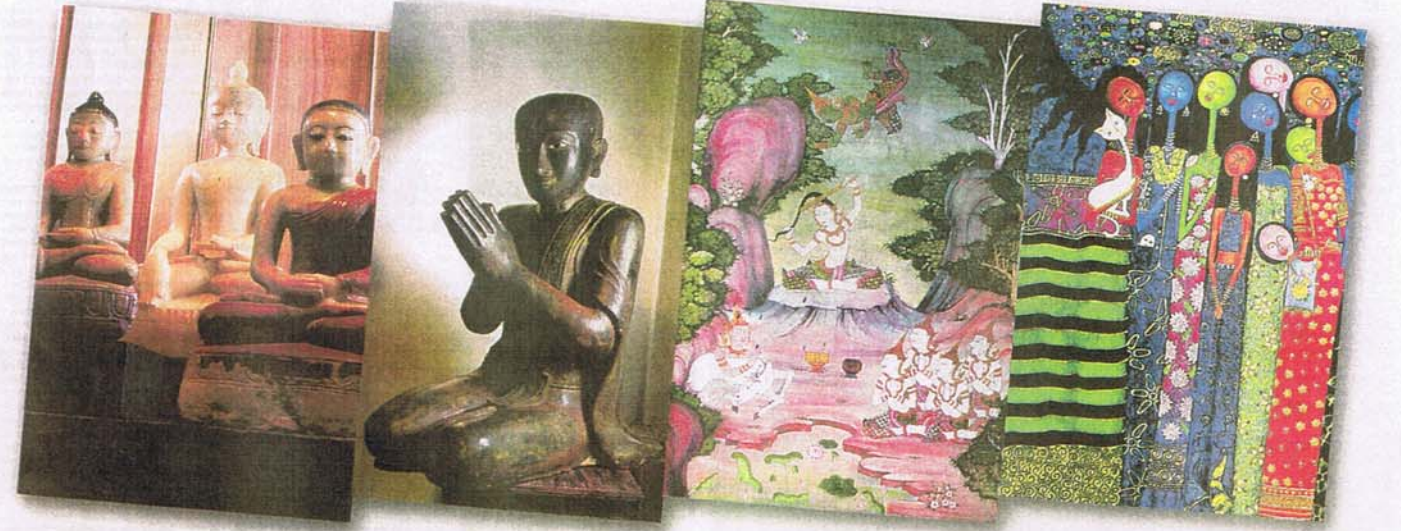
FRONT LEFT: Chan's Antiques and Art located on Tesco-Lotus junction has one of the largest collections of antiques in Southeast Asia; (third from left) intricate original Thai style painting on a piece of cloth; and a painting depicting the near extinct Sakai people of southern Thailand.

Y ou've come to paradise on Phuket surely for the crystal azure waters and some of the best silky sand seen anywhere. Regardless of the time of year, Phuket's scenery is breathtaking, however during the months of April to October, the southwest monsoon winds are prevalent and with them come some overcast days and rain, not always conducive to sunbathing. But fear not, off the beach in Phuket offers a rich cultural history and intriguing walks.