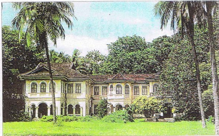
Phra Pitak Chinpracha Mansion on Krabi Road, a sketch from Architectural Society in Bangkok.