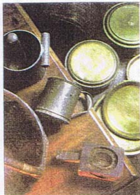
Brass serving sets and other utensils at China House.